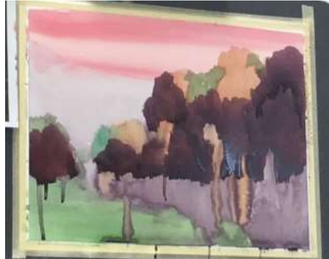
Darker values added