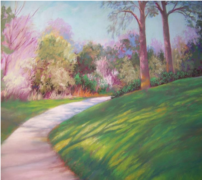
Patterns In The Grass