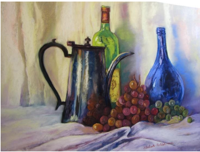
Grapes Bottle and Wine