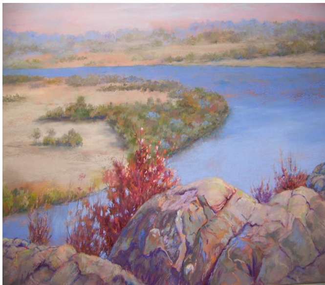
Petit Jean Vista