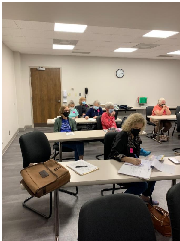
These were listening too