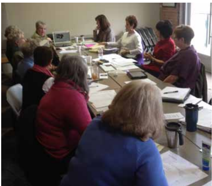
Scenes from the quarterly Board Meeting at the Butler Center.